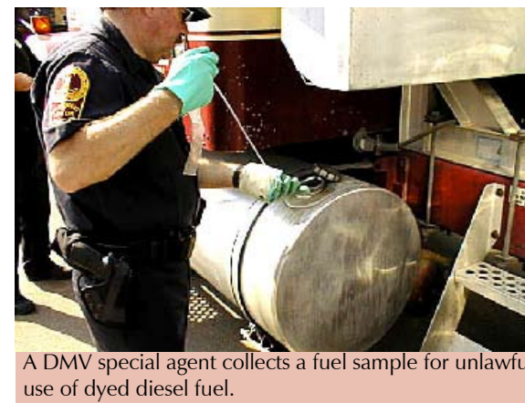
A DMV special agent collects a fuel sample for unlawful use of dyed diesel fuel.

Any person who refuses to allow an inspection or collection of a fuel sample is subject to a $5,000 penalty for each refusal. If the refusal is for a vehicle fuel sample collection, the penalty is assessed to the registered owner of the vehicle. If the refusal is for a sample to be taken from any other storage tank or container, the penalty will be payable by the owner of the storage tank or container. Va. Code § 58.1-2267